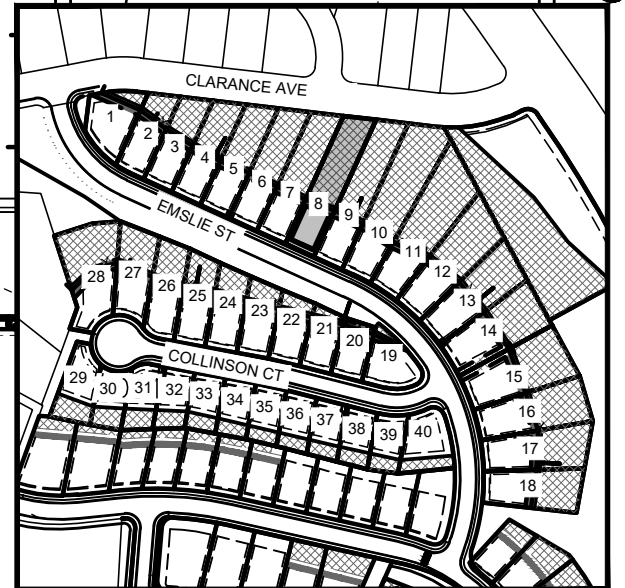
KEY PLAN SCALE 1:5000